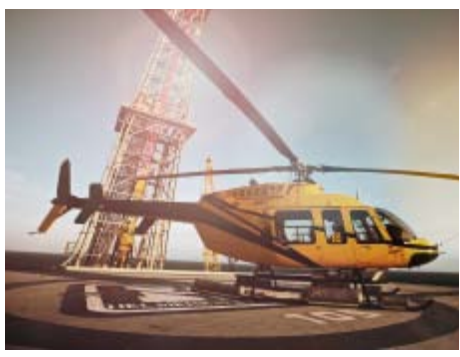
Commissioning and maintenance service