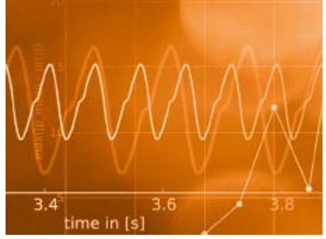
Pulsation studies and pipeline calculations