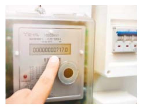
Lifecycle concepts and energy optimization