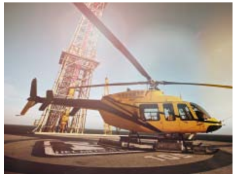
Commissioning and maintenance service