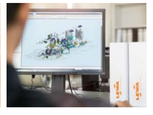
System layout and integration