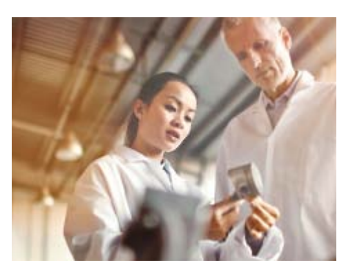
Creative development and refinements